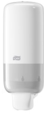
Tork Skincare Dispenser White 561500