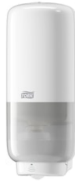
Tork Soap-Sanit Disp – Int Sens, wh 561600