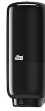
Tork Soap-Sanit Disp – Int Sens, bl 561608