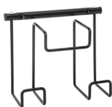
54961 Katrin Industrial Holder For Folded Wipes